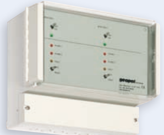
Geopal GJD-04C Dual line alarm monitor for connection of two detectors.